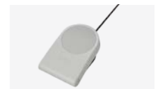
Foot Switch FS-24*