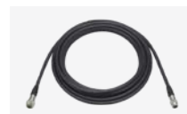
Camera Cable CCMC-SA06: 19.6ft (6m) CCMC-SA10: 32.8ft (10m) CCMS-SA15: 49.2ft (15m)